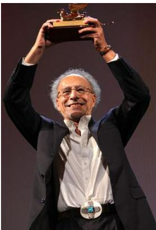
Monte Hellman at the Venice Film Festival holding the cherished Golden Lion, awarded to him by Quentin Tarantino. Monte is proudly wearing the AFF Maverick Award, a belt buckle with the New Mexico Zia, presented just days earlier.